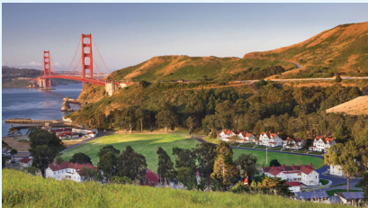
CAVALLO POINT San Francisco / Sausalito, California