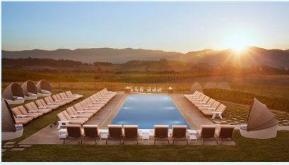
CARNEROS RESORT AND SPA Napa, California