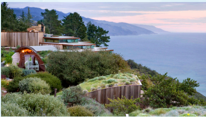
POST RANCH INN Big Sur, California