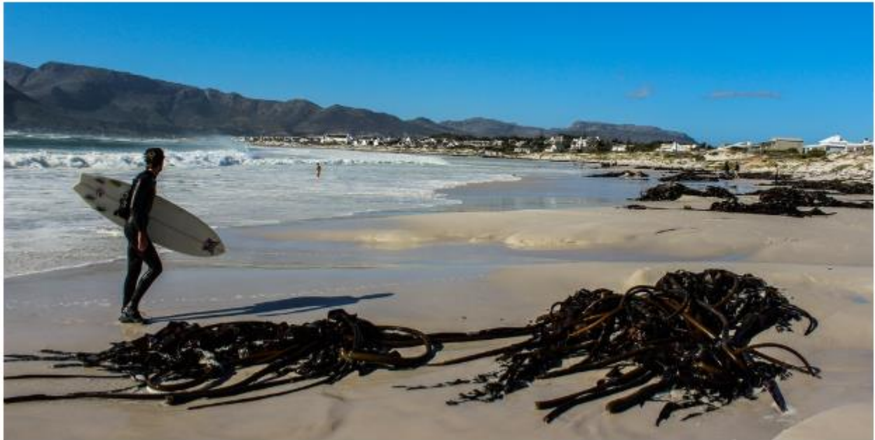
Kommetjie Beach is a big surf spot with sweet waves.

Also, I just need to reiterate how amazing the view is.