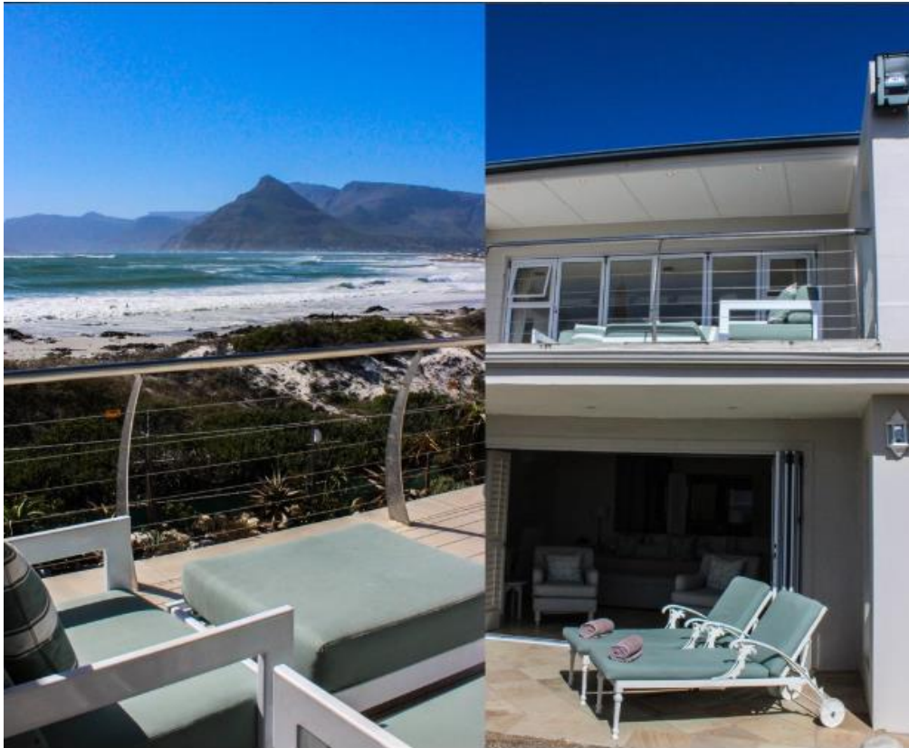
Sneak-peek into The Last Word's Long Beach boutique hotel.

With a choice between two elegant suites - a junior suite and three superior double rooms - the setup makes you feel like you're staying at the house by yourself, only bumping into the other guests once or twice at the complimentary bar or at the continental breakfast.