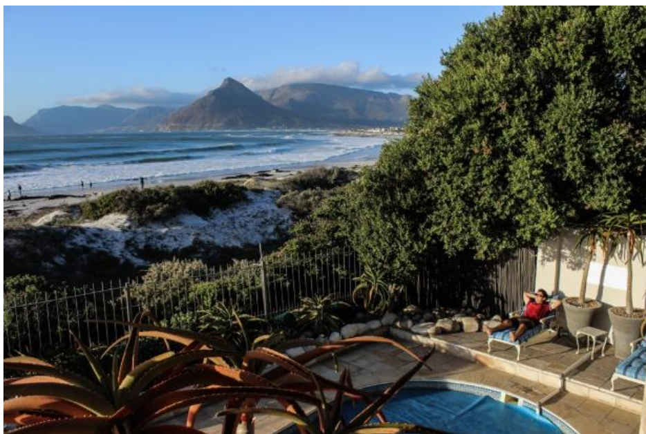
The pool is solar-heated and a bit warmer than the icy sea.

The rooms are split between upstairs and downstairs, where the pool is at if you're less keen on the cold Cape Town waters. Besides price, your choice of the suites can also depend on what you want out of your stay.