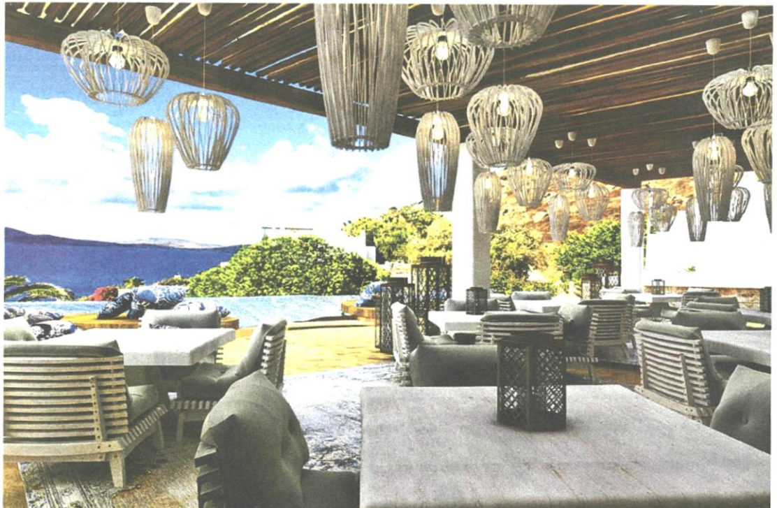
CLOCKWISE FROM ABOVE: KATIKOS MYEONOS, K CLUB, K CLUB, GRAND HOTEL CARBURG, SOHAD POP-UP HOTEL

Built in the 17th century as a gift from the Duke of Buckingham to his mistress, Cliveden House has seen plenty of drama, including the scandalous Profumo Affair in 1961 when a British war secretary became involved with the mistress of a Russian spy. Now operated as a 38-room hotel set