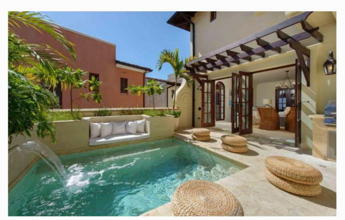
Soak up the charms of the new Santarena Hotel

Giving even more reason for travellers to soak up Costa Rica 's 'pura vida' lifestyle, is the new Santarena Hotel , a 45-room opening in the boho, car-free town of Las Catalinas.