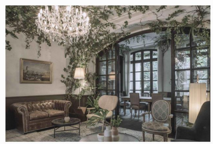
A botanical feel is felt throughout at Can Bordoy.

Highlights include Palma's largest private garden, which has over 70 plant species, as well as a diverse array of olive, jacaranda and fruit trees all flourishing in this centuries-old hidden space. As well as offering a quiet sanctuary, the garden will also be used for intimate dining and spa experiences.