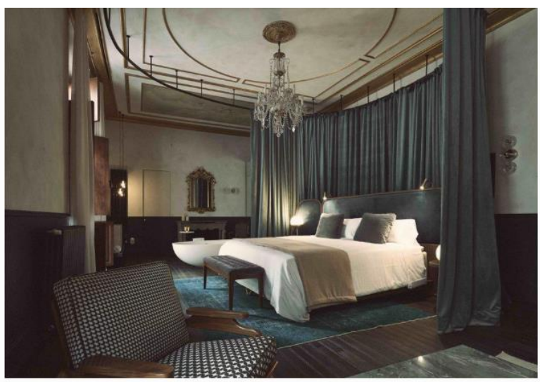
Grand interiors are a highlight at Can Bordoy.

Just opened in Mallorca, is the island's newest, and arguably most stylish, retreat. Can Bordoy Grand House & Garden is carved out of a 16<sup>th</sup> century property, and found behind a discrete façade in Palma de Mallorca's Old Quarter. With its personalised service and intimate feel, it feels more like a grand private home than a 24-suite hotel.