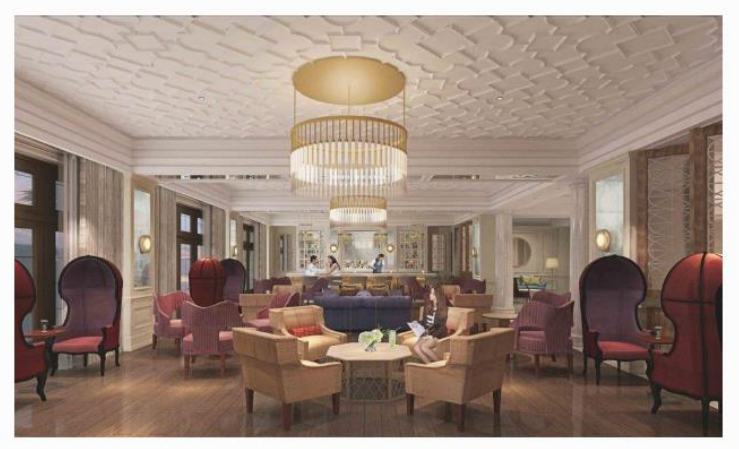
Dining is key at Hotel Bennett.

Slated to open its doors this month in Charleston, after 13 years in the making, is the much-anticipated Hotel Bennett . Hailed as one of the most opulent debuts in the American South, it will offer a traditional English sense of style married with a classic southern look. Carved out of the county's former library, it overlooks Charleston's iconic Marion Square, and will be one of the grandest hotels in the area.