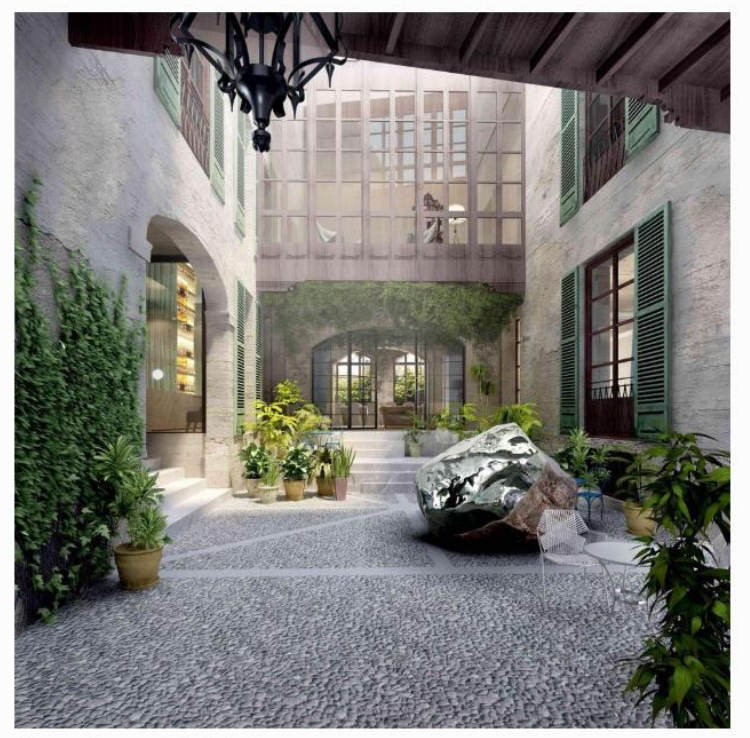
Where modern meets heritage.

Highlights include Palma's largest private garden, which has over 70 plant species, as well as a diverse array of olive, jacaranda and fruit trees all flourishing in this centuries-old hidden space. As well as offering a quiet sanctuary, the garden will also be used for intimate dining and spa experiences.