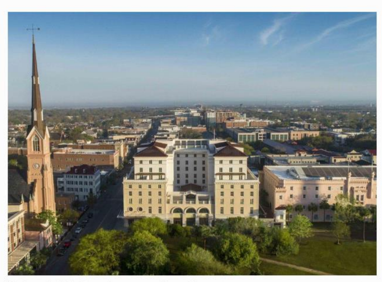
The imposing Hotel Bennett was once a former library.

Slated to open its doors this month in Charleston, after 13 years in the making, is the much-anticipated Hotel Bennett . Hailed as one of the most opulent debuts in the American South, it will offer a traditional English sense of style married with a classic southern look. Carved out of the county's former library, it overlooks Charleston's iconic Marion Square, and will be one of the grandest hotels in the area.