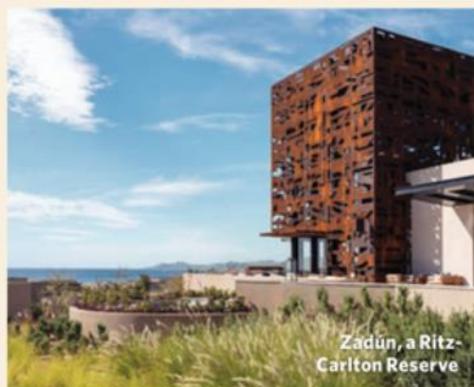
Zadún, a Ritz-Carlton Reserve