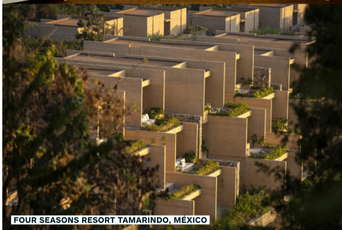
FOUR SEASONS RESORT TAMARINDO, MÉXICO