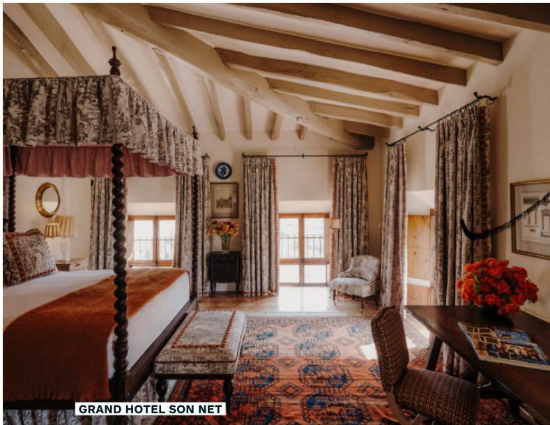
GRAND HOTEL SON NET