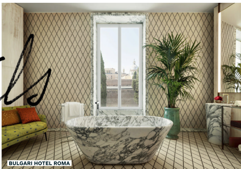
BULGARI HOTEL ROMA

Tapped to update the 18th-century Palazzo Salviati Cesi Mellini, Patricia Urquiola did a deep dive into the history of the Eternal City, layering travertine, cocciopesto, and mosaics into verdant spaces that evoke tranquil gardens. The spa's baths (encompassing a caldarium, a tepidarium, and a frigidarium) are not to be missed. From $900/night; sixsenses.com/rome