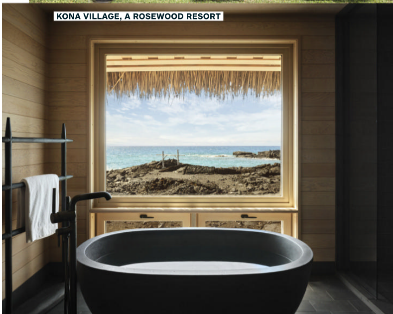
KONA VILLAGE, A ROSEWOOD RESORT