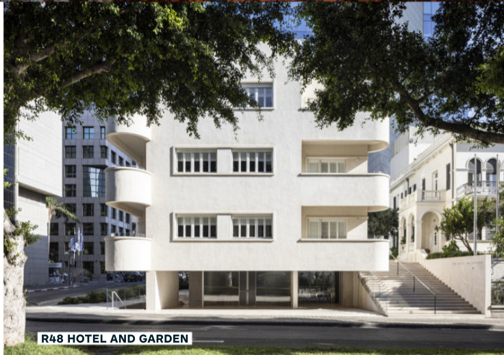
R48 HOTEL AND GARDEN