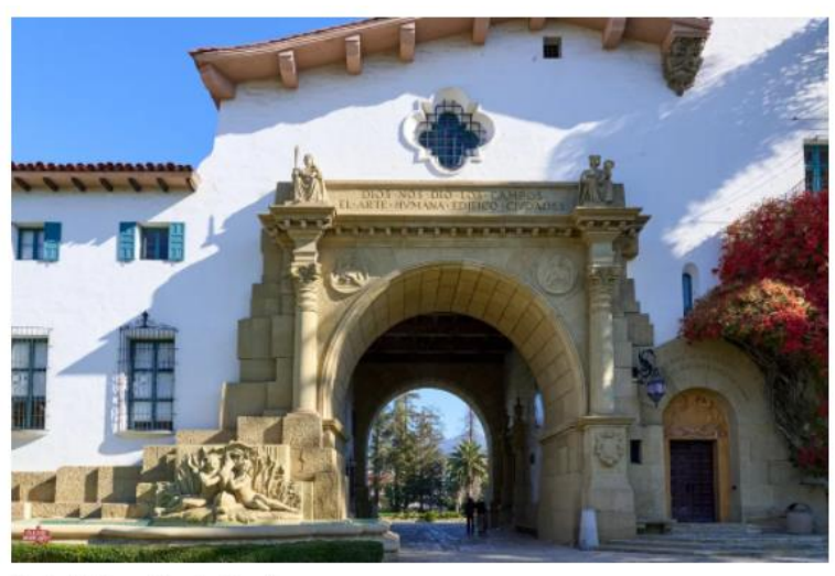
Santa Barbara County Courthouse