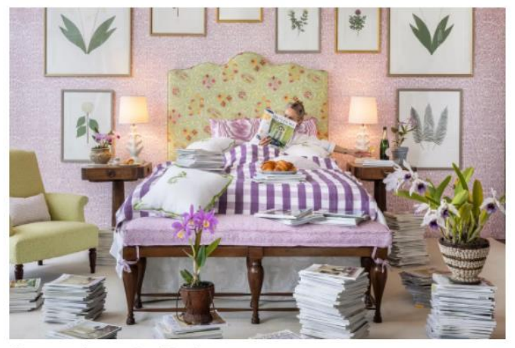
Showroom whimsy at Raoul Textiles