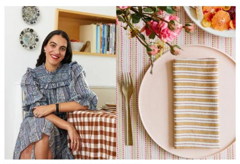
Heather Taylor Home at the Montecito Country Mart

First stop: Santa Barbara design legend The curated rooms of this workshop/showroom hybrid are IRL look books for the art of California living in a Mediterranean Revival world. Keep an eye peeled for this season's new wool-linen stripes, plus the workshop's latest Engle & Deutch armchair, based on a 19-century French side chair (open by appointment Monday-Friday).