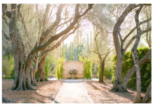
Olive Allee at Lotusland