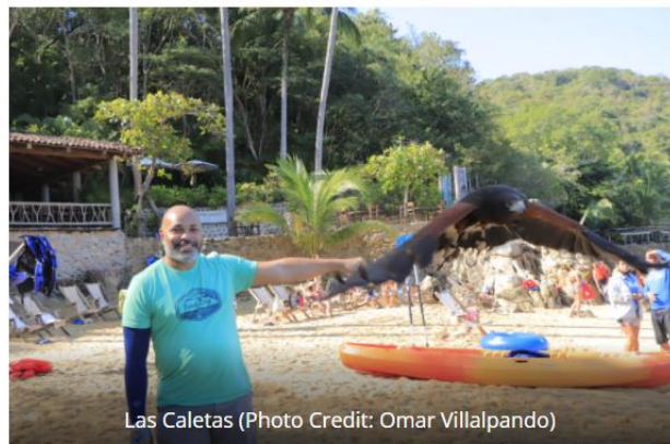
Las Caletas

And no matter the age of a guest, everyone can experience a personal encounter with the animals that live in the eco-park. I mean who wouldn't want a one-on-one connection with a bird of prey or a sea lion, right? Don't worry – animal trainers are