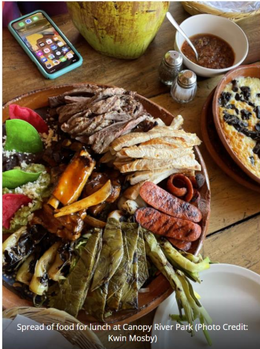
Spread of food for lunch at Canopy River Park