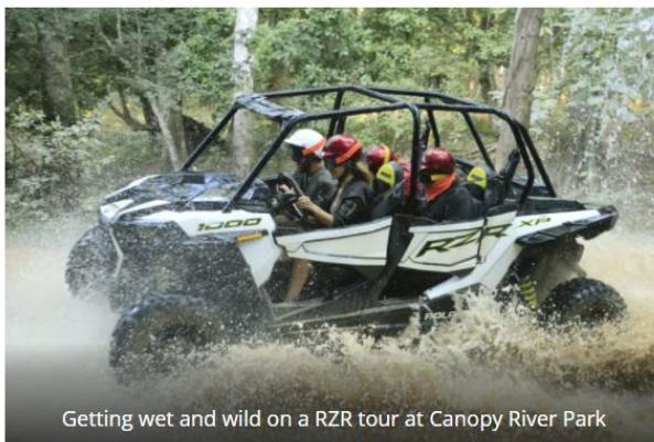
Getting wet and wild on a RZR tour at Canopy River Park

Most visitors have access to the park’s onsite amenities, which include the brand-new infinity pool. Although ziplining is the activity that rakes in the most money for the park, ATV and RZR tours also attract visitors.