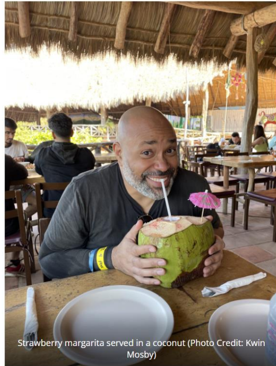
Strawberry margarita served in a coconut

Disclosure: The author traveled as a guest of Visit Puerto Vallarta , but all opinions expressed are entirely his own.