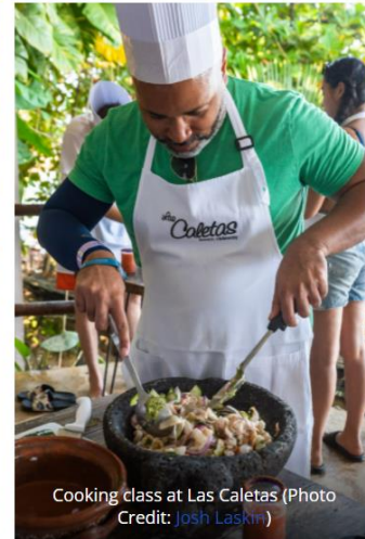
Cooking class at Las Caletas

At night, Las Caletas transforms into a popular destination because of its spectacular show, “Rhythm of the Night – Savia,” written and directed by Gilles Ste-Croix, co-creator of Cirque du Soleil. Guests enjoy a gourmet candlelit dinner and watch performers bring the birth of the Aztec civilization to life with spectacular acrobatic skills, pulsating rhythms, vibrant dancing, and amazing costumes.