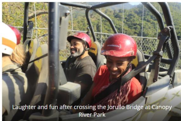
Laughter and fun after crossing the Jorullo Bridge at Canopy River Park