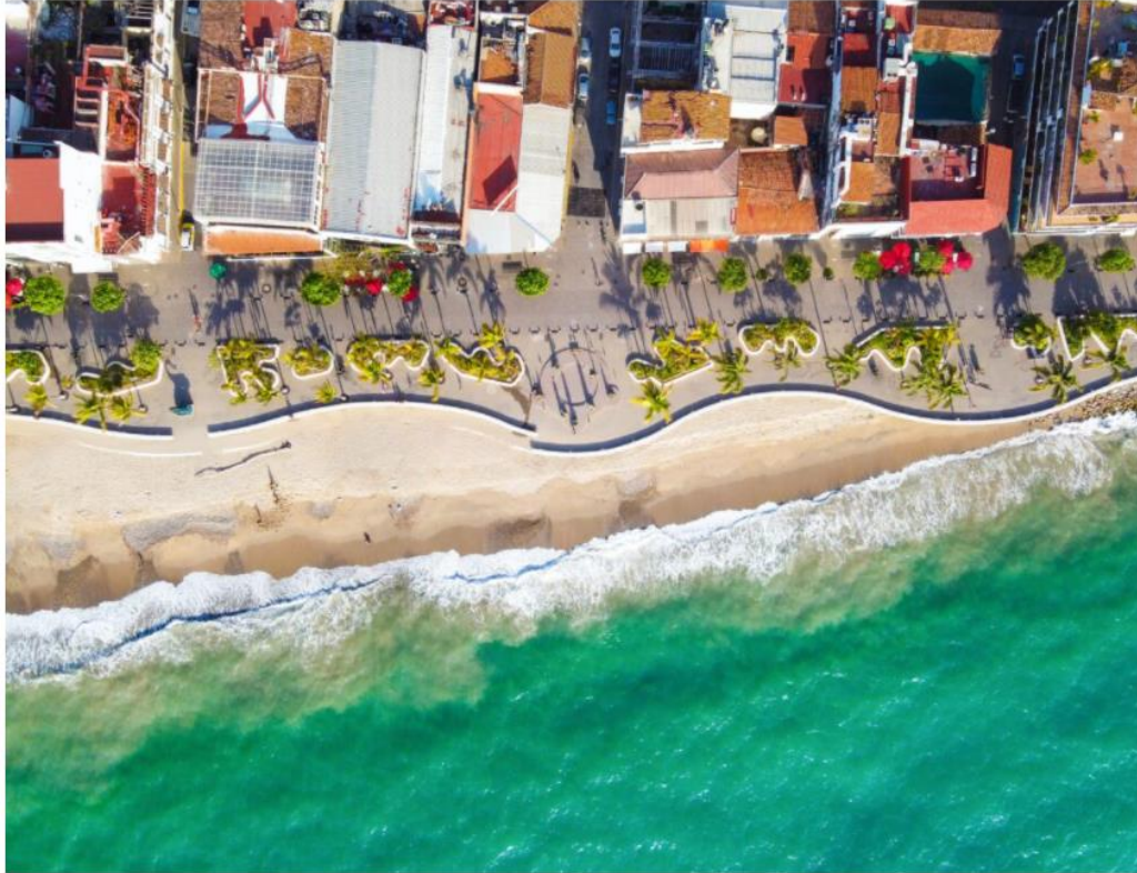
Puerto Vallarta Malecon