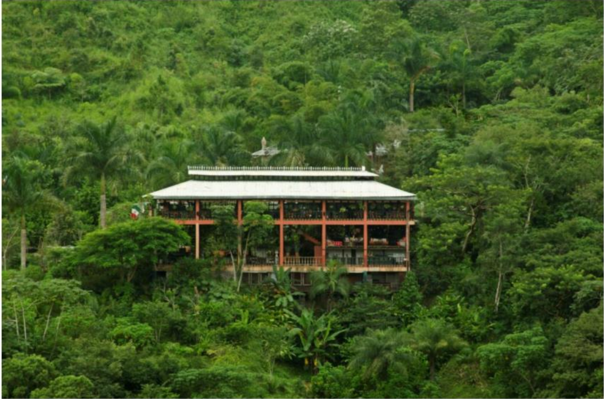
Vallarta Botanical Gardens