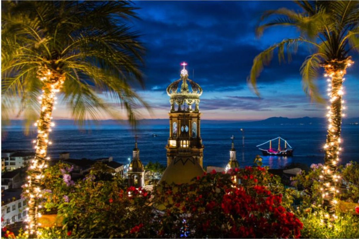
Our Lady of Guadalupe located in the center of the Romantic Zone