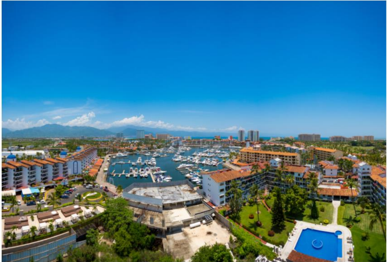
Puerto Vallarta Marina

By day or night, the Romantic Zone will be one of your favorite hang-out spots to enjoy a coffee along with a traditional or international dish or trendy mixology by Los Muertos Pier with stunning views of the bay.