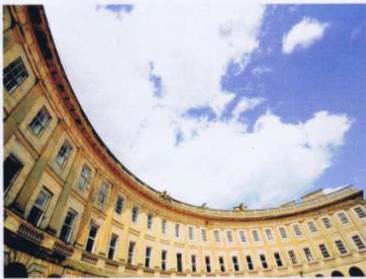
MORE BANG FOR YOUR BUXTON The Georgian crescent in this Derbyshire town is being remodelled as a five-star hotel and thermal spa