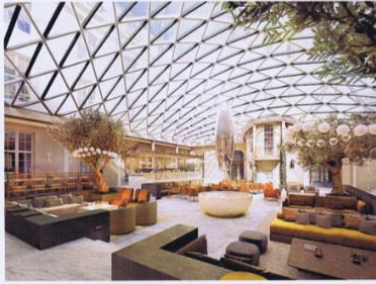
GREAT DANE The transformation of Copenhagen's former post and telegraph head office into a luxury hotel retains the building's original features, while adding 21st-century flourishes

● Elsewhere, Four Seasons Hotel Bangkok at Chao Phraya River will finally open on 1 April, with a series of cascading waterfront buildings, multiple courtyards, suites with garden terraces and a private jetty. There will also be an urban spa and two river-facing pools. fourseasons.com/bangkok ● Half Moon in Jamaica's Montego Bay is celebrating its 65th anniversary this year and this month it unveils Eclipse at Half Moon , a new 57-room hotel in addition to the existing hotel and villas, housed in a series of low-rise plantation house-style buildings, with a spa with overwater treatment rooms and a private beach with a swimming cove.