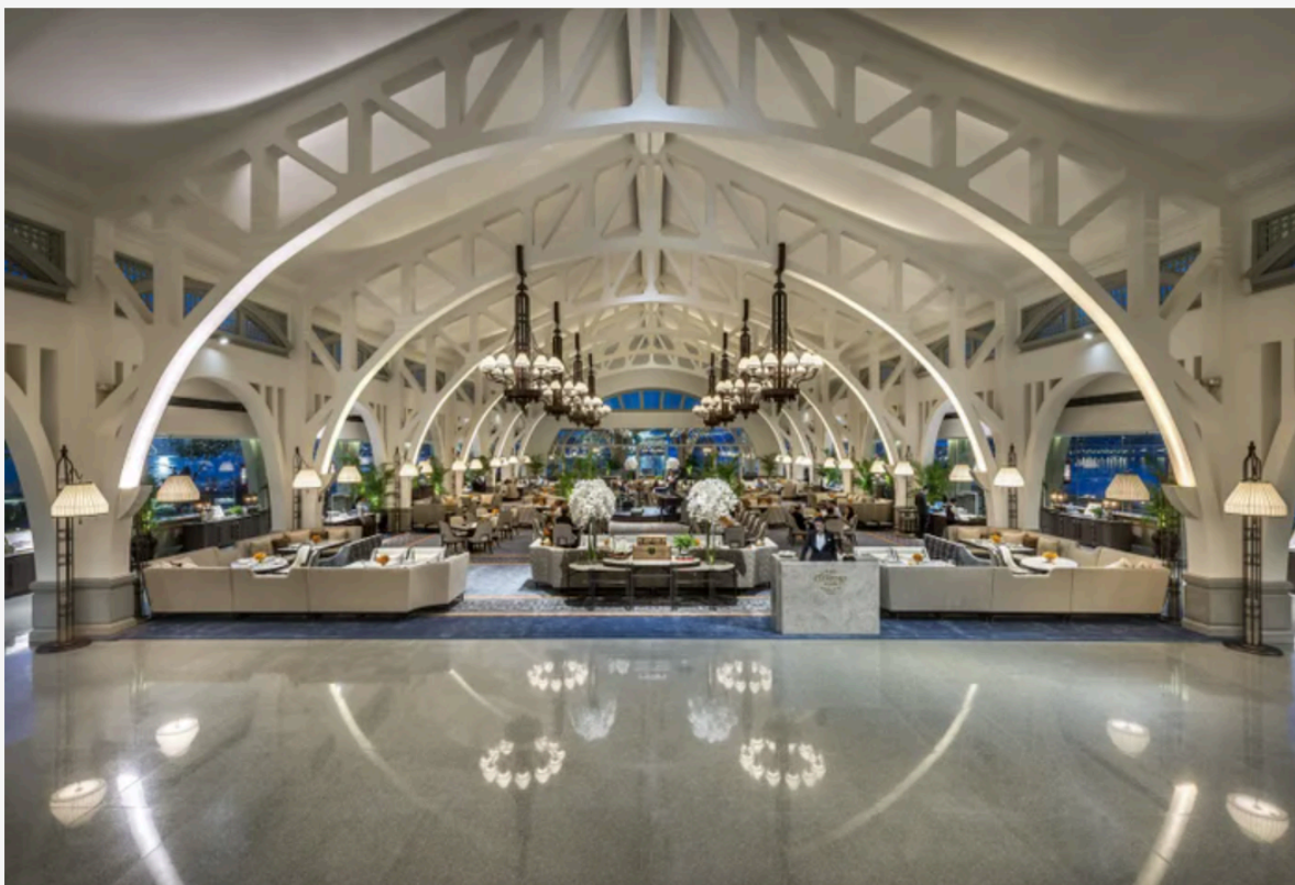
The Fullerton Bay Hotel in Singapore is part of the Preferred portfolio.