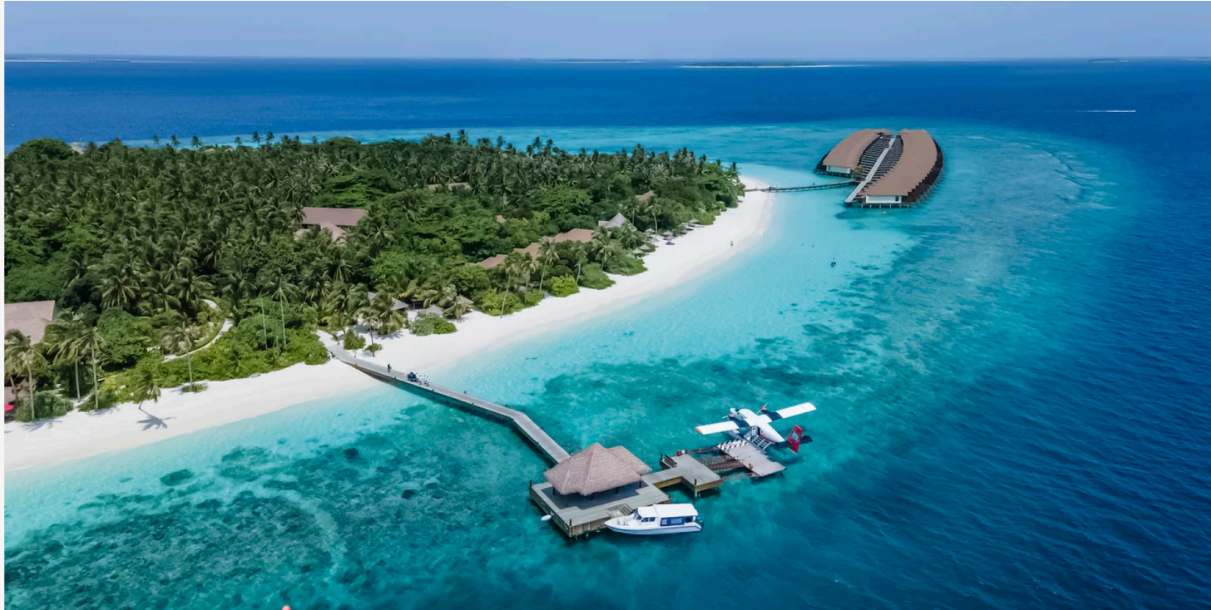
Reethi Faru Resort, a Maldives property in the Preferred Hotels & Resorts portfolio.

Normally, you earn 10 points for every dollar spent at most Preferred properties. That means it would normally take you $2,700 in spending to earn the 27,000 points you can get for a single stay if you take advantage of this flash booking offer.