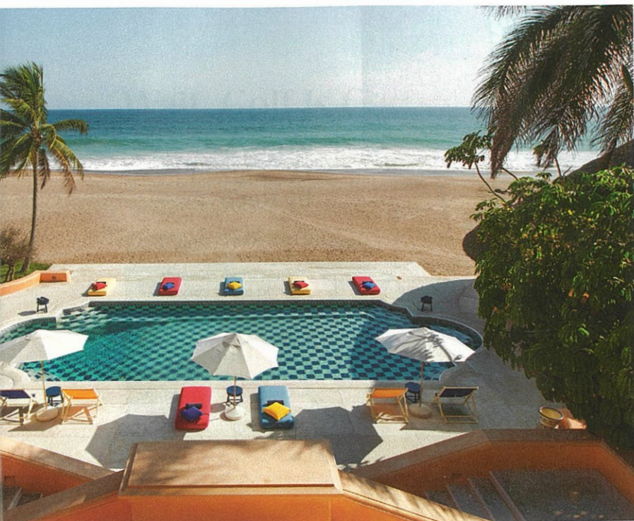
▲ The pool at Cuixmala overlooks a two-mile stretch of beach on the Costalegre.