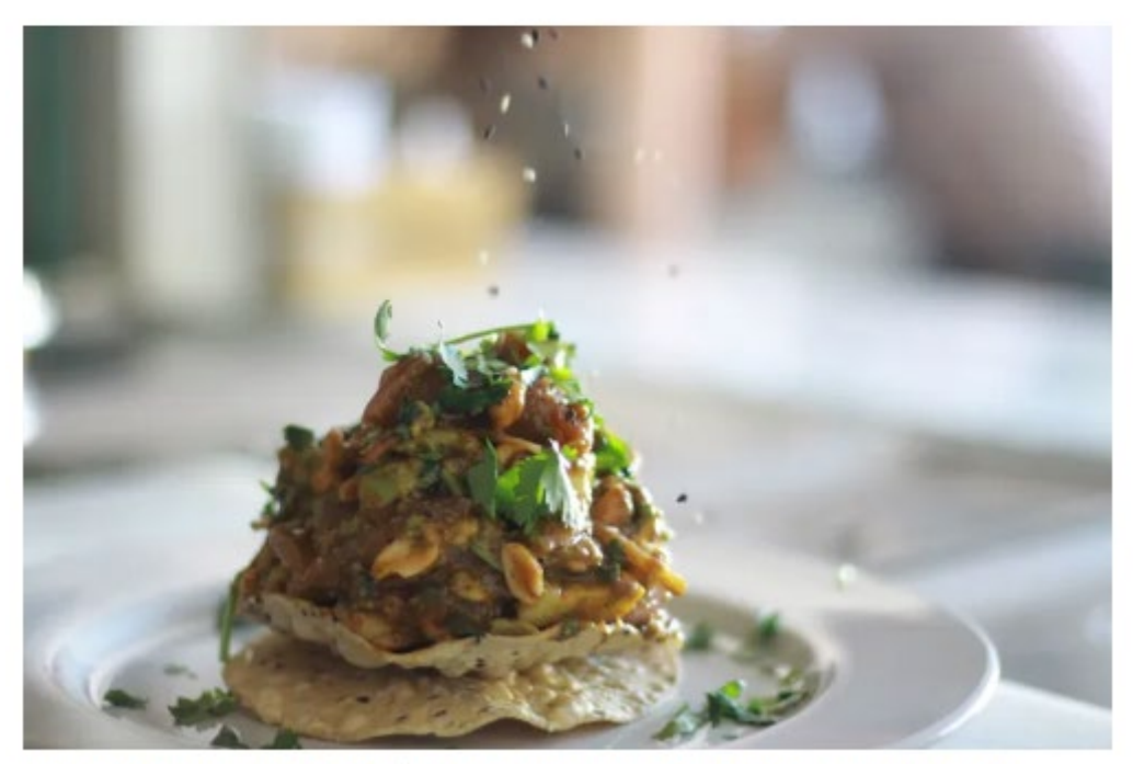
Tostada de Ceviche Bahía.

One of the top reasons to come to Puerto Vallarta is to try the food. Local specialties include seafood, birria, ceviche, and much more. Several tour companies offer local food tours to many different restaurants and street carts. One of the best foodie experiences is Vallarta Food Tours' Versalles Tour.