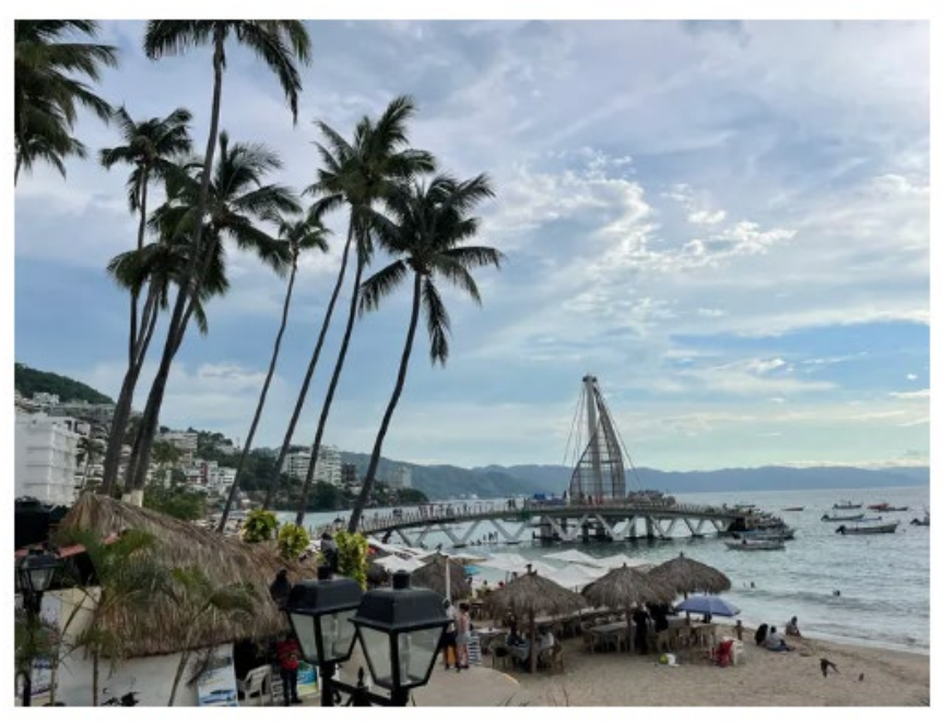
View of Los Muertos Pier in Puerto Vallarta, Mexico.

Puerto Vallarta is one of Mexico's greatest beach destinations. Except these days, it is so much more than just a great beach town.