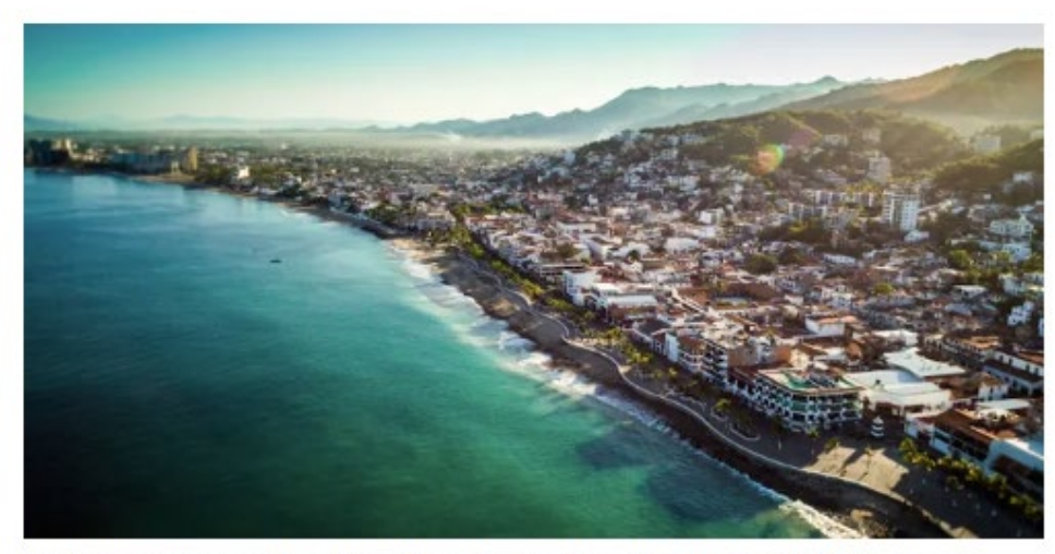
Visitors will want to get out on the water.