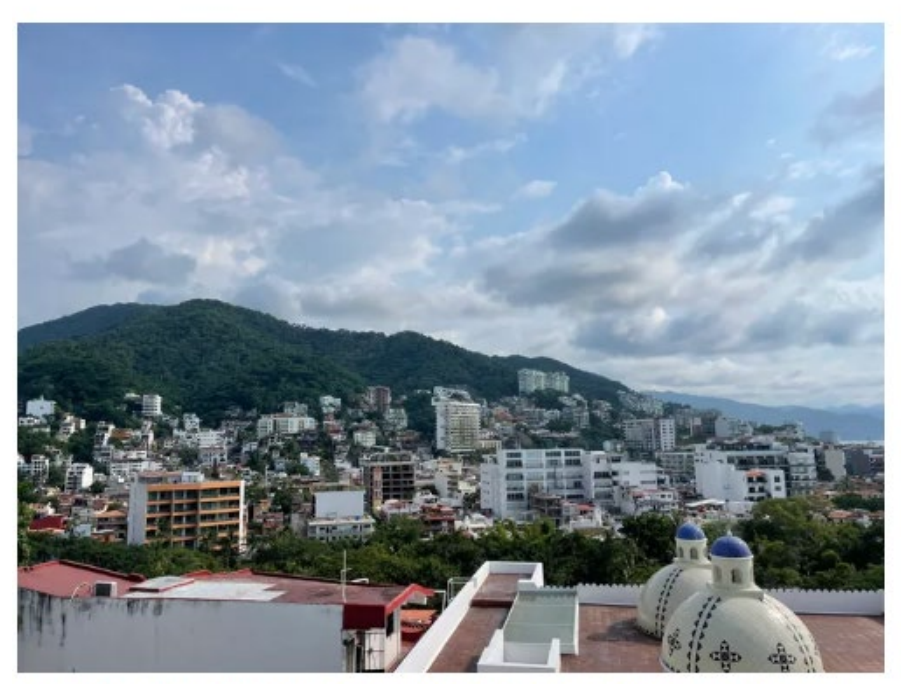
View of Puerto Vallarta, Mexico.

Another option is to head north to the neighboring state of Nayarit to visit the now world-famous Sayulita. This Magical Town has long been a favorite among surfers and backpackers, but in the past few years has exploded to have art galleries, restaurants, and bars. It can get crowded, especially on weekends, but it is one of the top attractions near Puerto Vallarta.