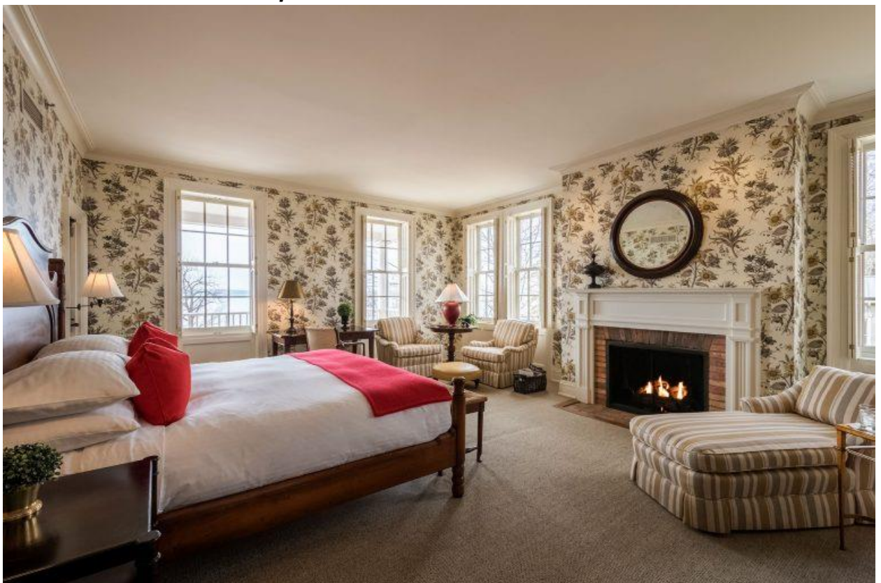
Inns of Aurora - Aurora, New York

Also located in the Finger Lakes region of New York, <u>Inns of Aurora</u> is a collection of five historic buildings comprising 54 luxe guest rooms and two suites. <u>Perfect for road trippers</u>, the property has a holistic spa offering hydrotherapy and wellness treatments for those looking to decompress.