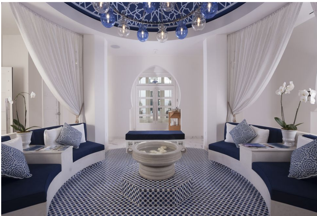
The Spa Majorelle lounge at Hotel Californian. Hotel Californian

Spa time: Spa Majorelle at Hotel Californian treated me to a full-body massage that literally left me feeling like a brand new human. The space was so calming (think: Moroccan blue tiled walls, soft spa music playing in the background, and essential oils diffusing in every room.) The best part—besides the actual massage, of course—was the massive fluffy white robe I was cozied up in as I waited for my masseuse. Over at The Ritz, I was treated to a Body Melt—a treatment that's basically a full-body exfoliation followed by an invigorating Swiss Shower. Basically, I emerged from these treatments a lighter, happier person. Enough said.