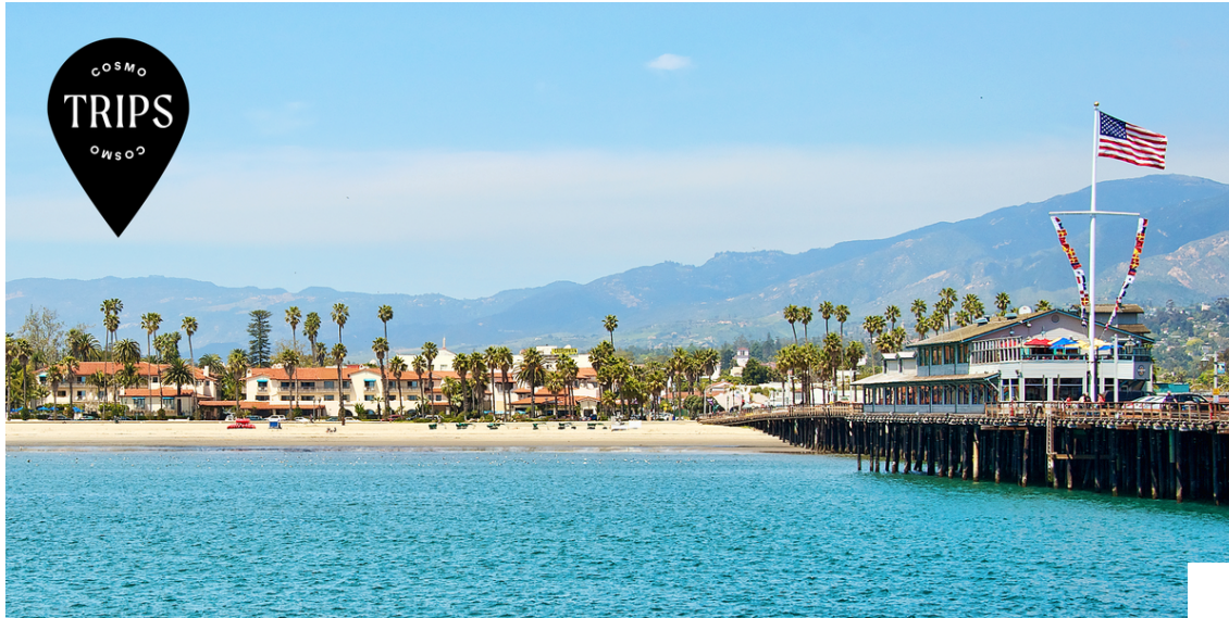
Visit Santa Barbara

I'm just a Midwest girlie living in NYC, meaning I've had very little experience with nice weather between the months November and April. No, I didn't grow up in a family that took tropical vacations during the holiday season, nor was I part of a family that leaned into the winter szn with regular ski trips . Nope, we braved the winter like your typical middle class Americans in Missouri. So! When Visit Santa Barbara offered me a lil trip to Cali during the harsh, gray winter on the East Coast, I jumped at the chance. My fiancé and I had been looking for a some relaxation prior to the upcoming hectic holiday season, so we packed our bags and headed across ze country.