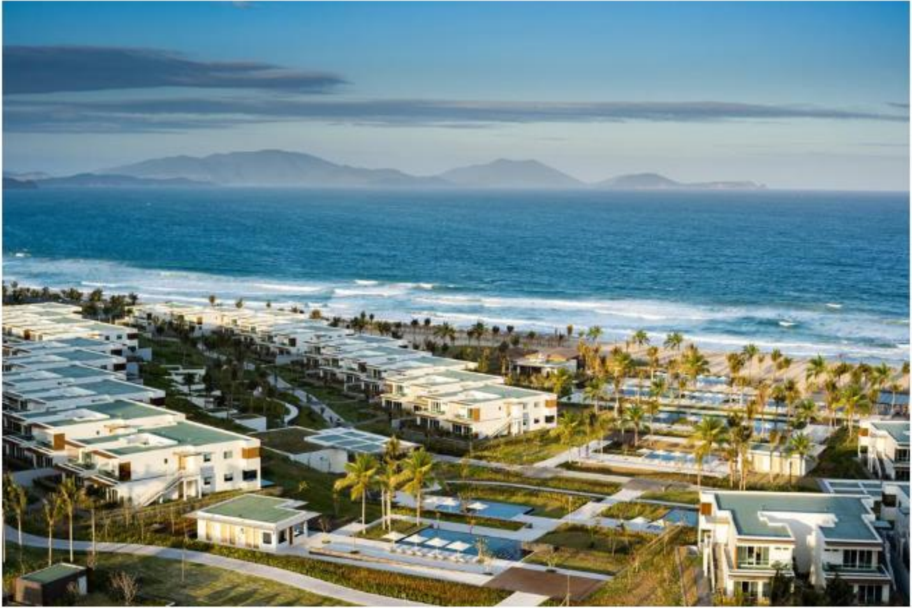
Alma Resort in Cam Ranh, Vietnam joined Preferred Hotels & Resorts this year.