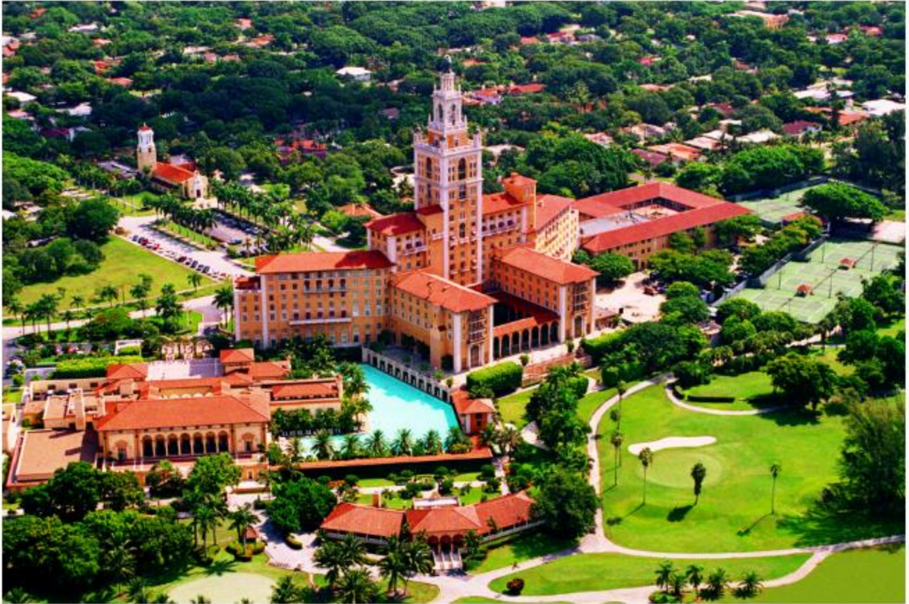
The Biltmore Resort in Coral Gables, Florida joined Preferred Hotels & Resorts in June.

hotels, costs 12,500 points; a $250 gift certificate costs 125,000 points. There are several different monetary value certificates for which guests can use their points. This method takes away the need for standard room availability or other stipulations that come with larger programs.