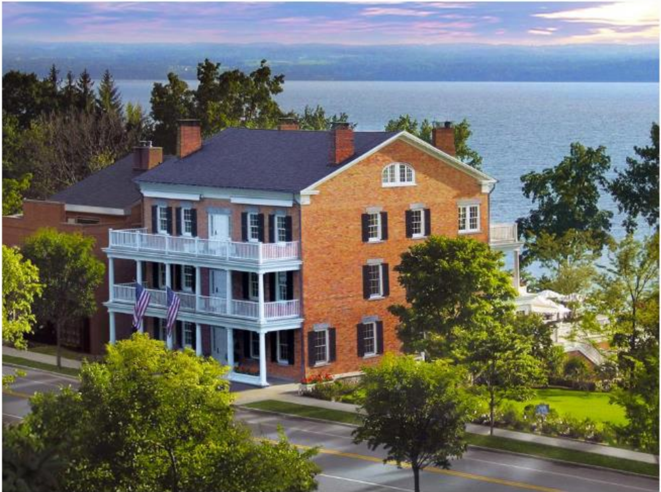
Inns of Aurora in New York's Finger Lakes region PREFERRED HOTELS & RESORTS

To earn Elite status, members must earn 50,000 points within one year of your membership joining date. There are no minimum night or stay requirements.