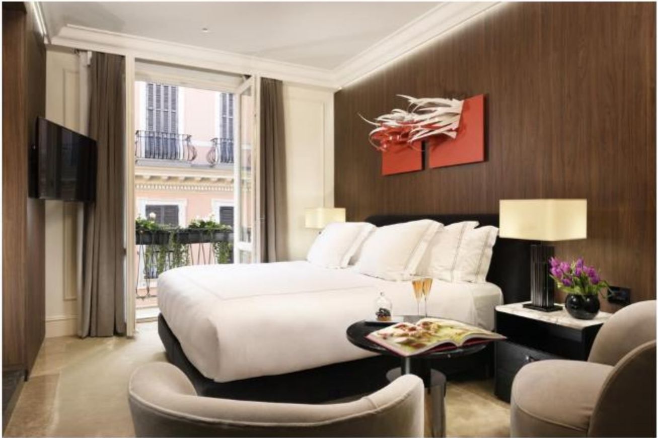
The First Roma Dolce in Rome | PREFERRED HOTELS & RESORTS