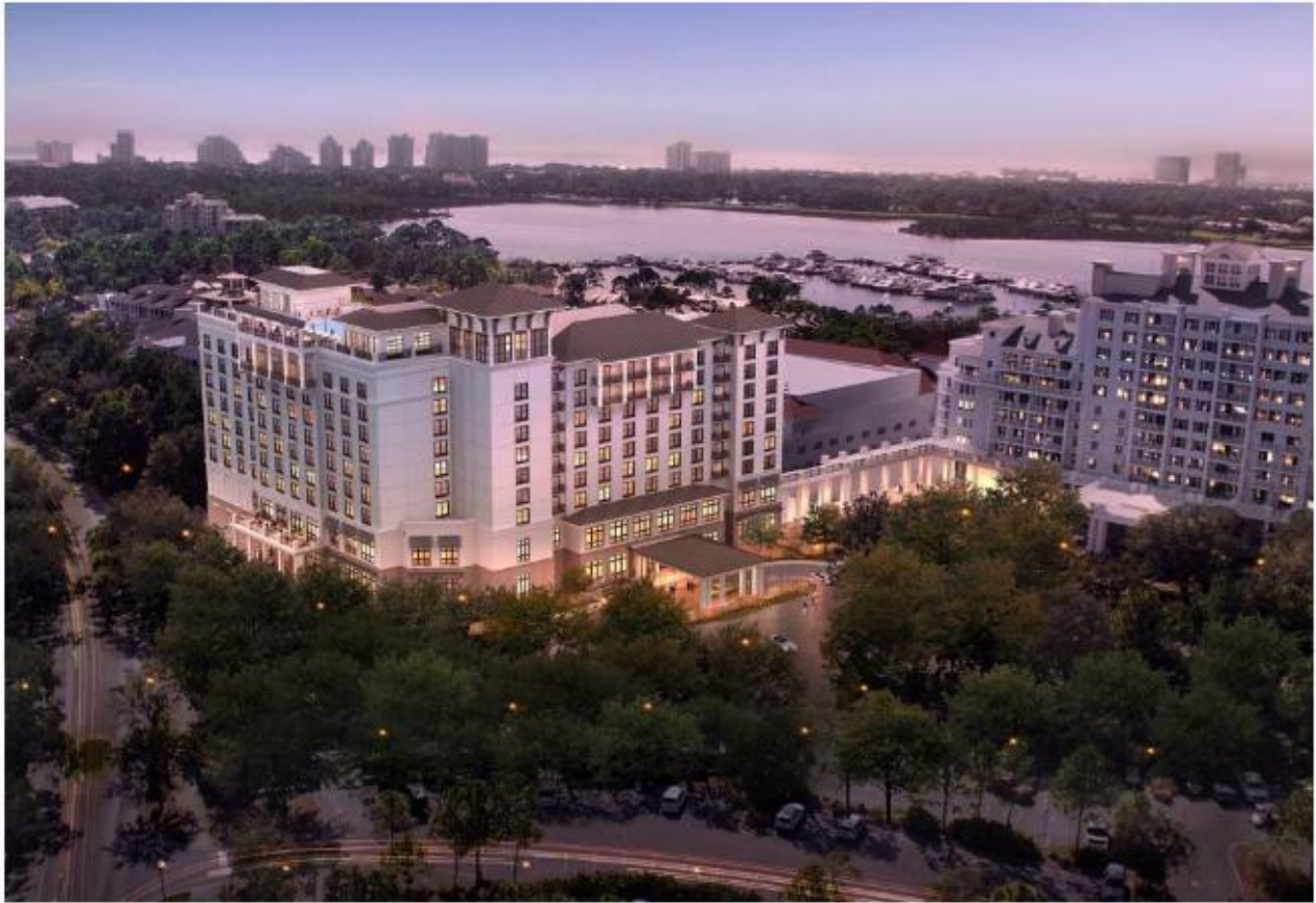
The new Hotel Effie Sandestin in South Walton, Florida is a member of Preferred Hotels & Resorts.