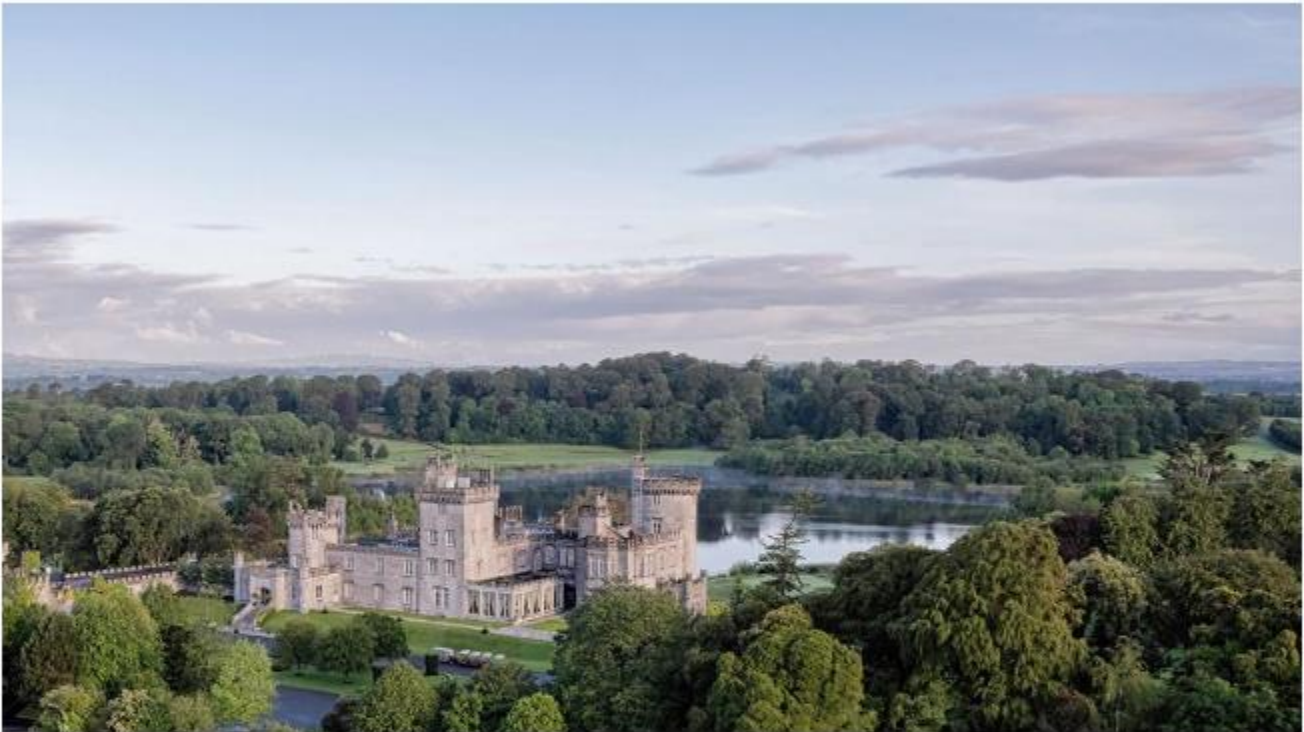
Dromoland Castle in County Clare, Ireland, a member of Preferred Hotels & Resorts since 2013. PREFERRED HOTELS & RESORTS

and a portfolio of more than 700 participating distinctive hotels, resorts, and residences across 85 countries. I Prefer offers the benefits of a robust points-based loyalty program without the formulaic approach of a larger one.