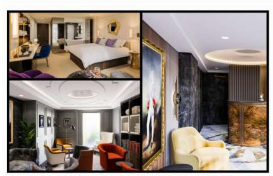
Guest bedroom at the newly open Guardsman hotel in Westminster PREFERRED HOTELS & RESORTS THE GUARDSMAN LONDON

Named after the British-American politician, Lady Nancy Astor, whose image bedecks the walls, The Astor Suite reflects the neighborhood as the current and historic seat of government. Both the Houses of Parliament and Buckingham Palace are just a short walk away.