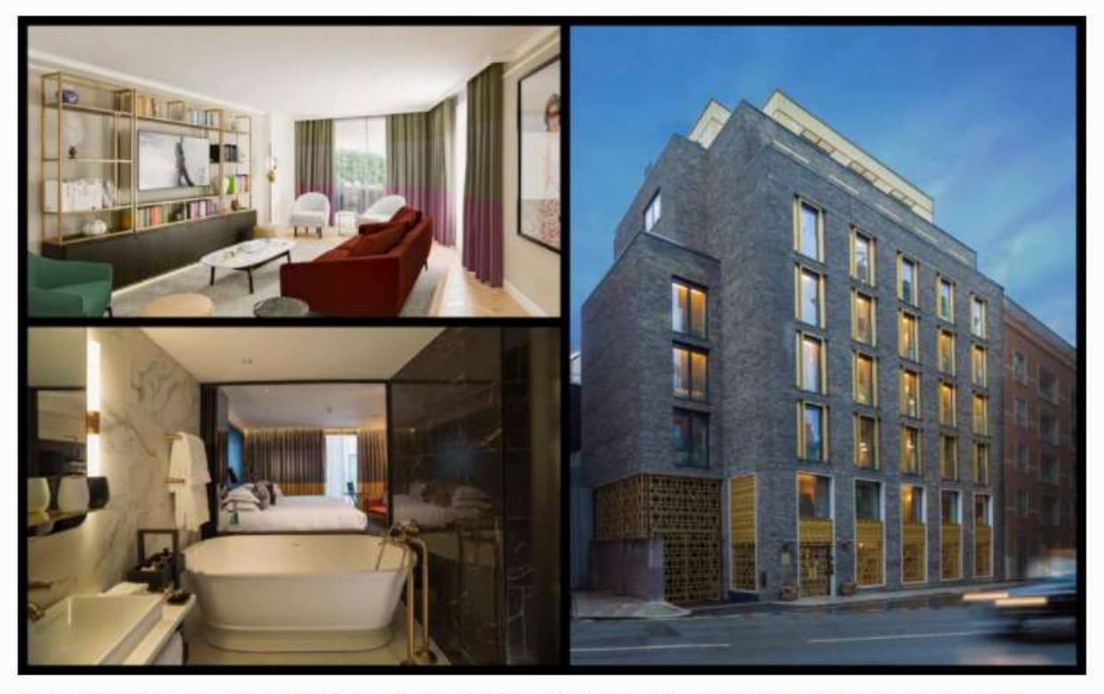
From street-level, The Guardsman is understated but refined PREFERRED HOTELS & RESORTS THE GUARDSMAN LONDON

From street-level, The Guardsman, a member of the prestigious Preferred Hotels & Resorts portfolio, doesn't look like your typical hotel. Tucked away on the quiet Vandon Street just south of St James's Park and within walking distance of some of London's most popular landmarks, the purposed-built building is outfitted chicly (but understatedly) in geometric gray and gold accents and looks more like a new private luxury residence building than your standard London hotel—and that's precisely the point. The Guardsman is designed to be a home-away-from-home and the perfect London pied-à-terre for discerning travelers.