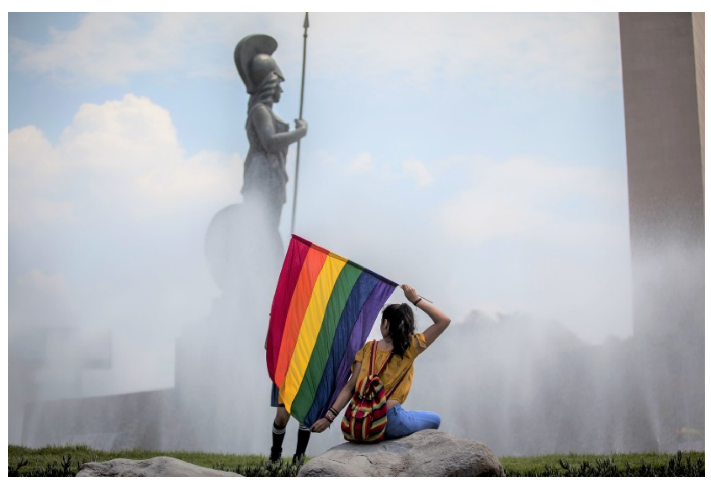
Marcha de la Diversidad, Guadalajara Pride

Mexico's second-largest city is considered an LGBTQ mecca and also an ideal place to explore Mexican culture—especially mariachi, tequila and charreria (Mexican rodeos), all of which are long-standing traditions in the region. Check into a trendy boutique property like the sleek Hotel Demetria or a luxurious hotel with hacienda-style elegance like the Quinta Real Guadalajara . The bulk of the LGBTQIA nightlife is in the historic downtown; dance clubs like California's and Caudillos Disco Bar are longstanding favorites. For a more youthful, upscale vibe, head to Envy , a gay nightclub in the hip Americana neighborhood. The city also hosts an impressively large Pride march in June.