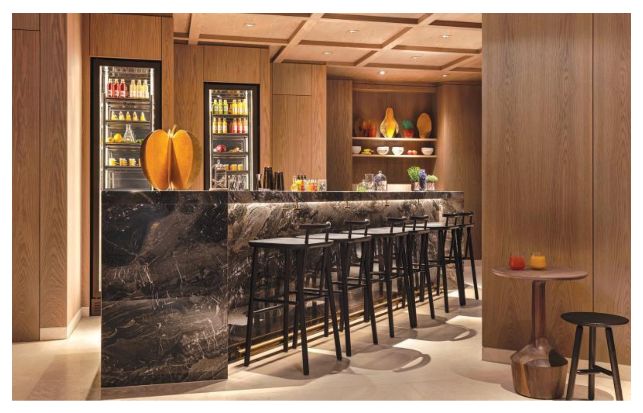
Refuel is the superfood and drinks bar designed to complement the treatments at The Retreat— The Londoner's underground spa.

The last F&B venue is Joshua's Tavern, a gin-focused bar that opens right onto Leicester Square. If you're a fan of gin and tonics, this is the place to be.