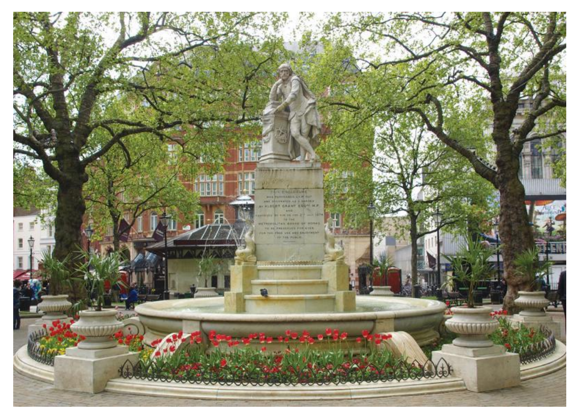
Leicester Square offers access to a myriad of theaters and museums and is in close proximity to both the stylish Soho and Covent Garden neighborhoods.

Fun Touch: Rooms also come with a pair of opera glasses—to better enjoy your city views, and just one more way the hotel connects to its location.