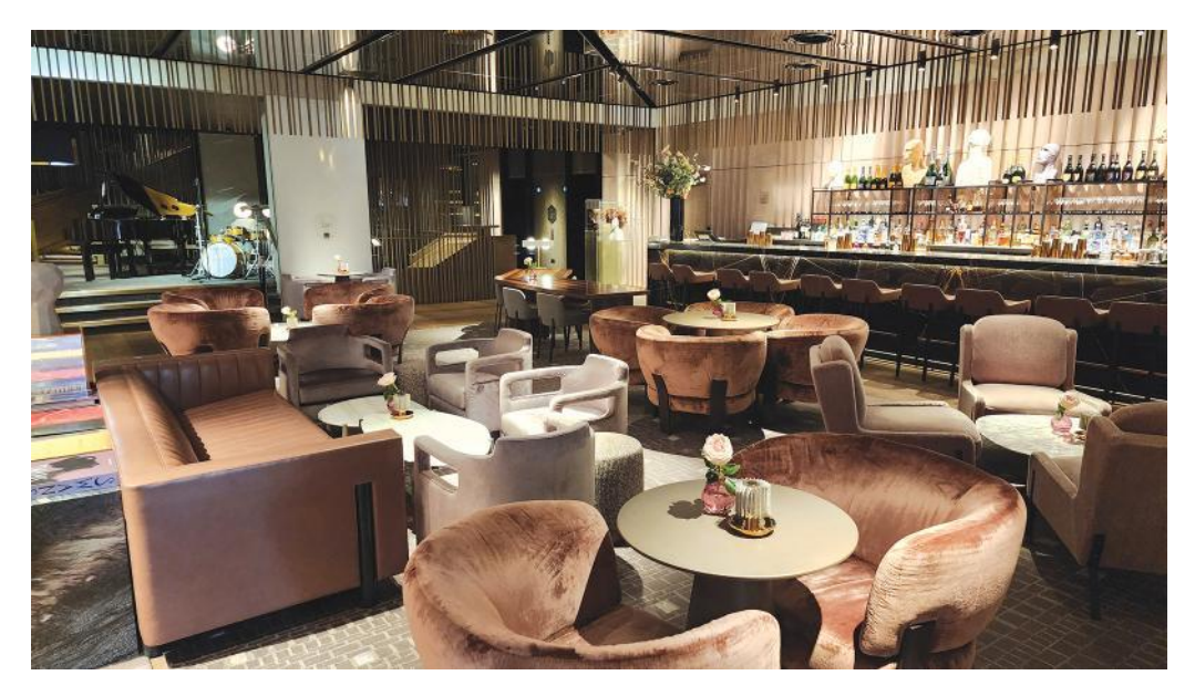
The Stage is the champagne lobby bar that presents itself in three "acts"—a morning champagne breakfast; a champagne afternoon tea; and a full cocktail and drink menu at night. (Matt Turner)

About one-quarter of the hotel's guests were American in 2022 but that number is expected to rise in 2023—especially as word gets out.