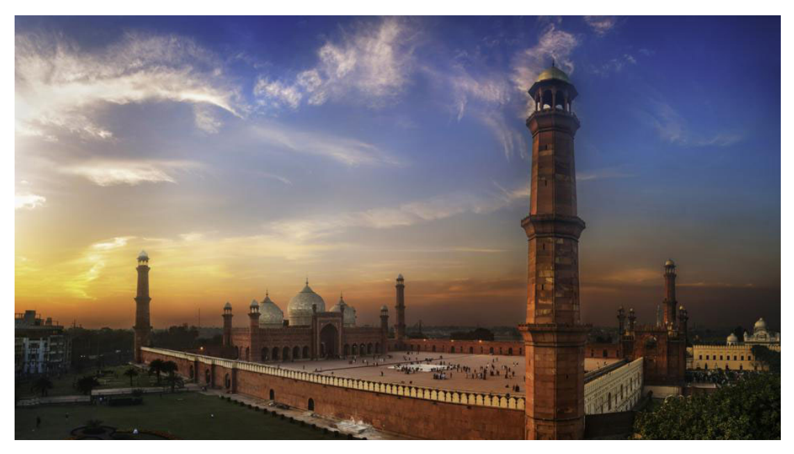
The Badshahi Mosque or "Imperial Mosque", a Mughal era mosque in Lahore, Pakistan.

Entry requirements: negative test within 96 hours for some countries; others exempt. The US and UK are not currently exempt from the requirement to present a PCR test. The list of countries that are exempt can be found here. Children under 12 and disabled passengers are reportedly exempt from the testing requirement regardless of their origin point. Visitors need to register with the Pass Track app (Android only) or through this web form. Arriving passengers may also be screened at the airport.