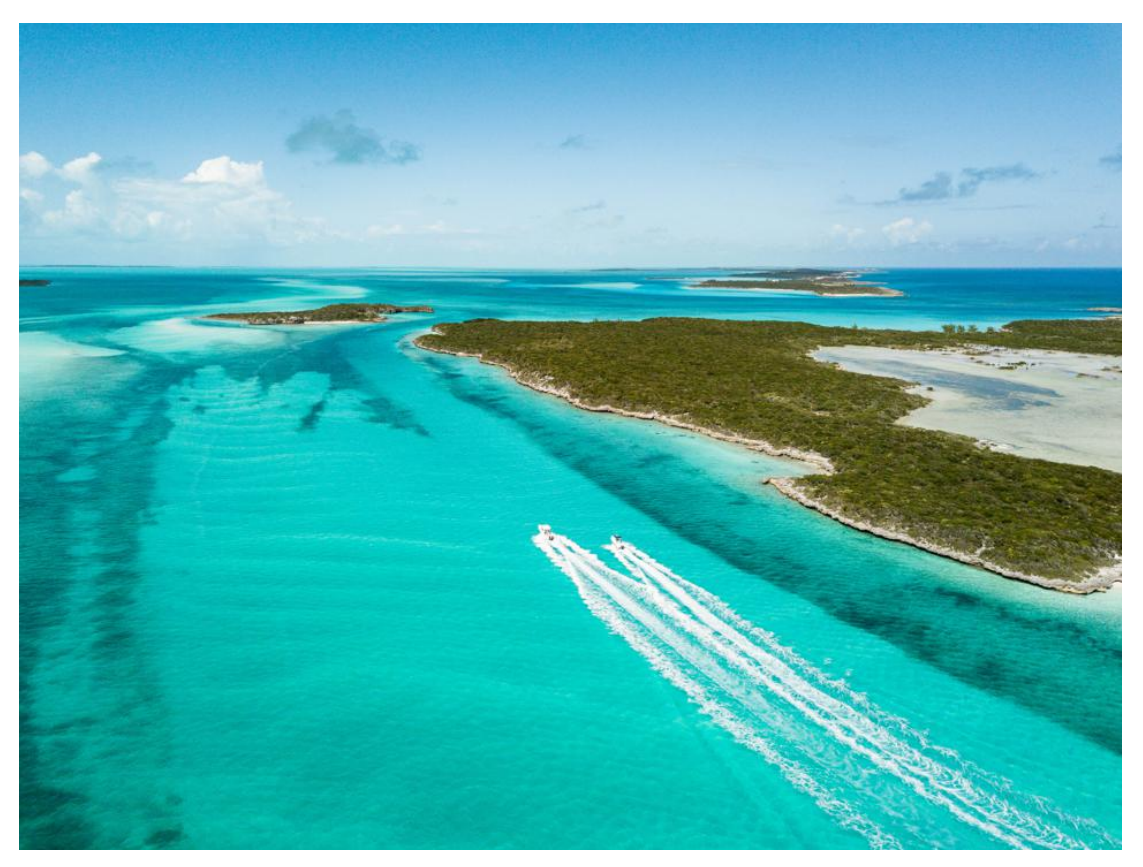
A typical Bahamas scene.

Entry requirements: negative test within 7 days of departure, approved health visa, test on arrival and test on day 5 (cost included in visa). The situation in The Bahamas is a little more complicated, but from November 1 it will reportedly become much easier to travel thre.