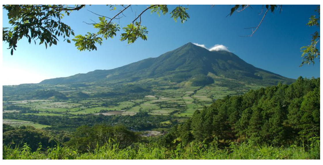
Panoramic view of Volcano San Vicente and valley bellow near San Salvador, El Salvador.

Entry requirements: negative test taken within 72 hours. El Salvador is open to everyone who wants to visit provided they arrive with a negative PCR test. Of the countries on this list, it has been open the longest and the protocol seems to be working fine so far.