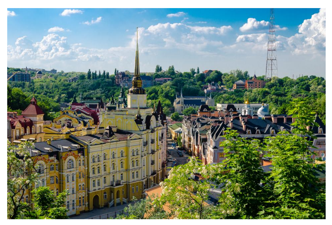
A scene from Kiev, Ukraine.

Entry requirements: negative test 48 hours prior or upon arrival to avoid quarantine for "red zone" countries including the US. Most countries are on the "green zone" list and for people arriving from those countries, provided they haven't been in a red zone for 14 days prior, no restrictions are in effect. For those from a "red zone", a contact tracing app must also be downloaded.