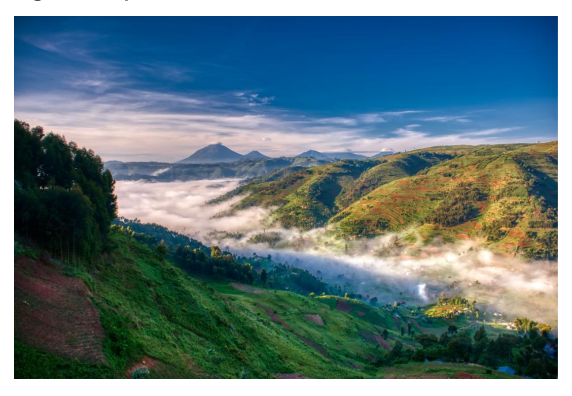
Dramatic landscapes in the highlands of Uganda.

Entry requirements: negative test within 72 hours of arrival AND a negative test before departure as well. Uganda is unusual in requiring a COVID test before leaving the country. That test needs to happen no more than 120 hours before departure. Keep in mind also that there is a national curfew between 9pm and 6am, though if you have a flight between those hours you are permitted to go to/from the airport.