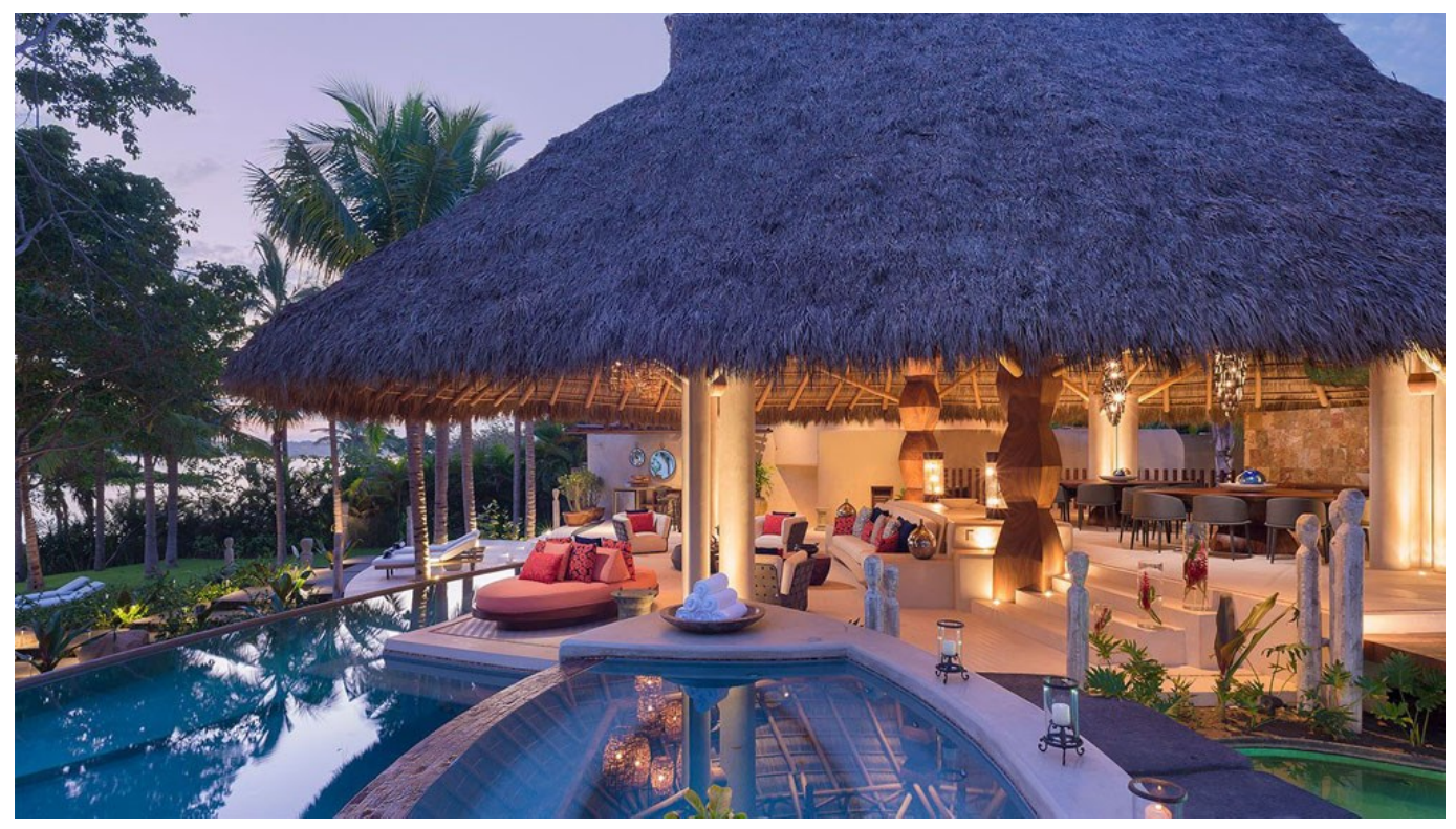
For a small group, consider a full property buyout of a small property such as Casa Tau in Punta Mita, Mexico.

With social distancing a hot topic around the globe, it is only logical that more travelers are looking for uncrowded vacation experiences. As one of the closest international destinations to the U.S., Mexico is especially well positioned to meet the needs of the "new normal," with unspoiled scenery and accommodations that make it easy to relax, enjoy nature and get pampered — far from the throngs of sun seekers.