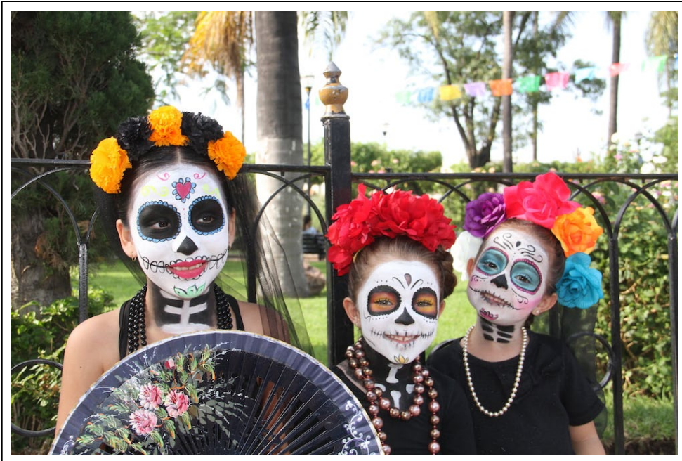
Family Día de los Muertos

Tapetes (carpet made of colorful wood chips) will be on display within the main square in AJIJIC . Día de los Muertos public altars will be placed throughout the Malecón area October 30-November 3 in PUERTO VALLARTA . The town of TEQUILA 's virtual Día de los Muertos events will be announced on October 23 here: www.vocesdetequila.org . In ZAPOTLANEJO , the town that owns three Guinness World Records, you can see the world's tallest Catrina sculptures and the biggest Catrina dress (from last year).