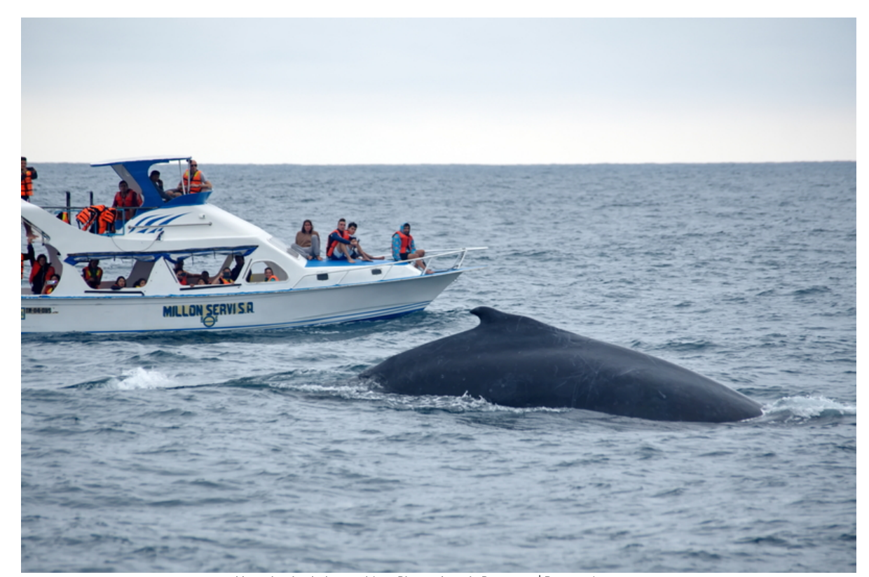
Humpback whale watching.