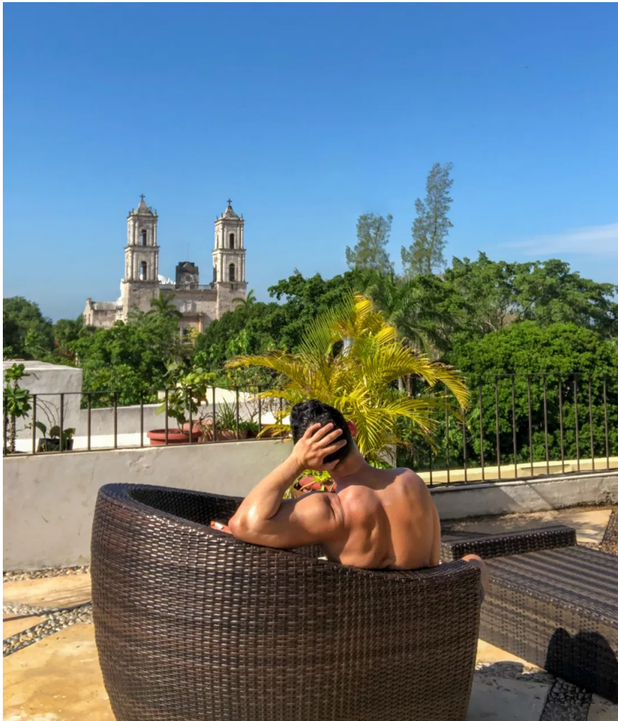
Enjoying Mexico's Magic

We can all use a little more magic in 2020.