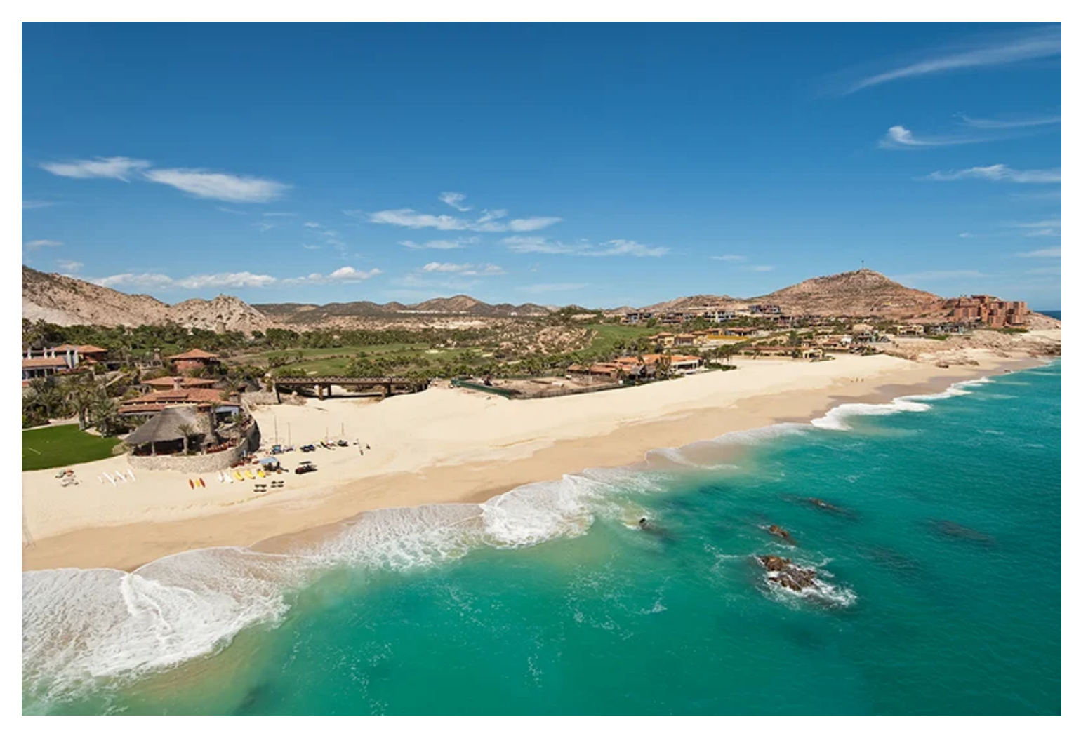
Cabo San Lucas

Destinations across Mexico are making their official reopenings, most with certifications from the World Travel & Tourism Council (WTTC) after meeting its standardized health