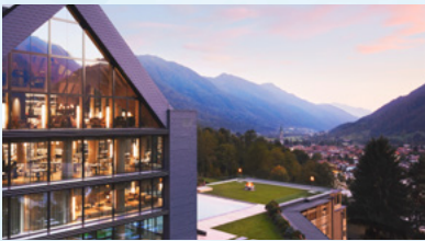
LEFAY RESORT & SPA DOLOMITI Dolomites/Pinzolo (Trento)

By car, 70 minutes from Turin, 2 hours from Genoa, less than 2.5 hours from Lake Como, Milan, and Monaco