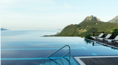
LEFAY RESORT & SPA LAGO DI GARDA Lake Garda/Gargnano (Lombardy)

By car, less than 90 minutes from Florence, 40 minutes from Siena, 3.5 hours from Genoa