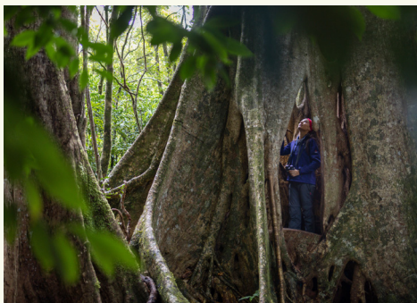
Senda Monteverde Hotel Monteverde, Puntarenas